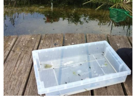
Newsletter 1 (4<sup>th</sup> May 2020)